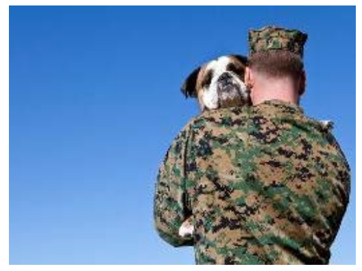
A counselor with PTSD needed to use a service dog at work to decrease his anxiety.