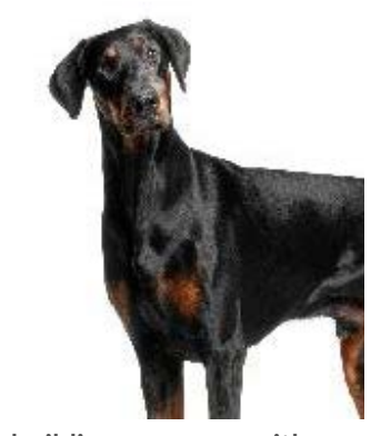
A building manager with pos stress disorder (PTSD) asked emotional support animal to her.